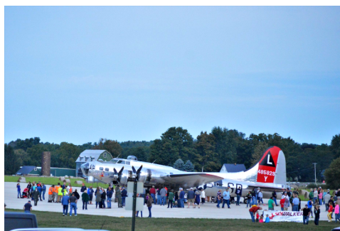
The community enjoying the historic B-17 Bomber at the 4th Annual Patriots Day Fly-in held on September 8, 2019.