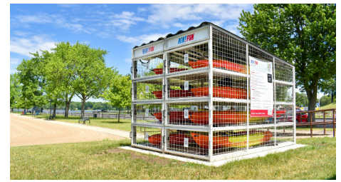
8-kayak rental kiosk located at Pike Lake & Center Lake in Warsaw, IN.

The City of Hillsdale's Recreation Department is currently working on a project that aims to improve outdoor recreational opportunities by installing a self-serve kayak rental station at Owen Memorial Park on Baw Beese Lake. Offering kayaks will not only enhance the park experience, but it will encourage more people to utilize the lake and the various public parks along its shoreline.