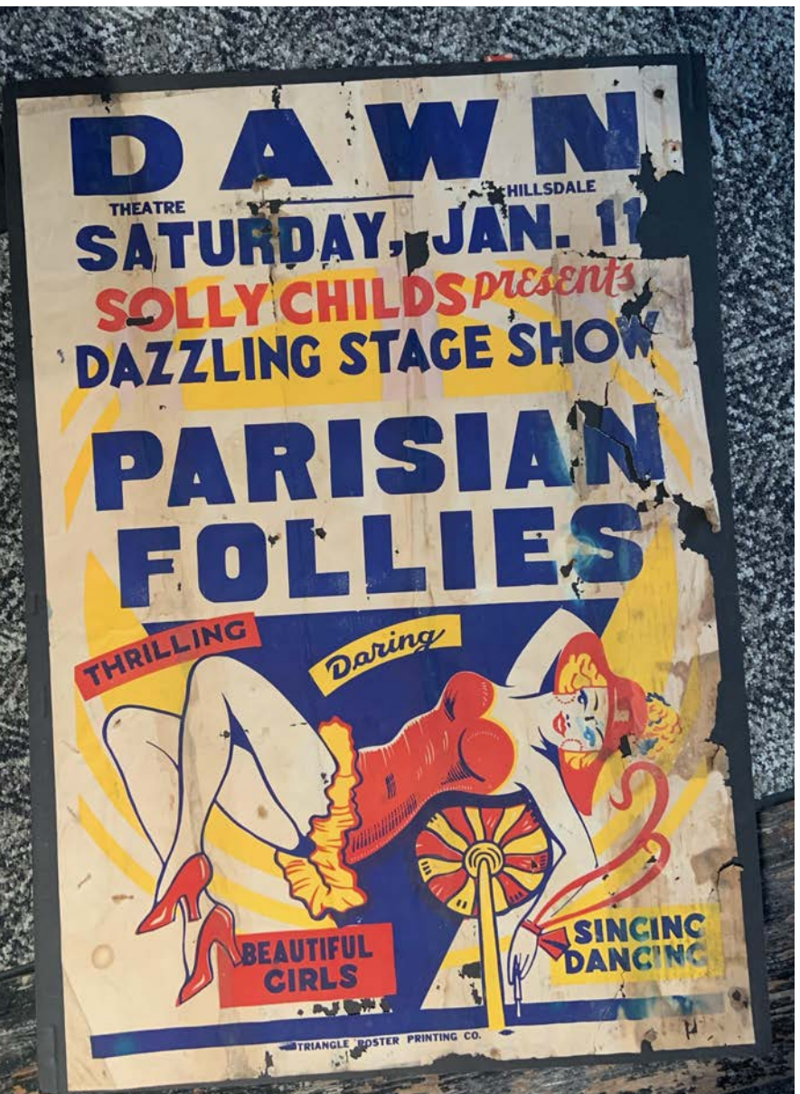
Attachment 1: Friends of the Dawn Theater: Old Movie Poster Restoration